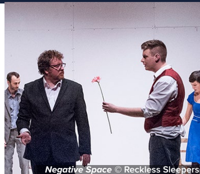
Negative Space © Reckless Sleepers