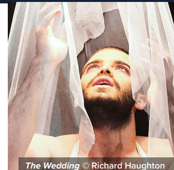
The Wedding

Access Digital Theatre+ via your school today!