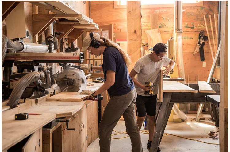
Figure 12. New shop, 2019.

KLEIN: The spectacles were an opportunity for the town to learn how to see things they might not be comfortable seeing. That's something I'm proud of, it's at the heart of what I am trying to do. A lot of different types of people from town came to The Grand Parade (2013) and they really loved it. We've brought our two kinds of performances into harmony with each other. We tour both the spectacles and our indoor work. And we're taking this model to other communities. We did The Odyssey , for example, on the Atlantic Ocean in Maine at the College of the Atlantic and we did Once a Blue Moon in Jamaica Plain near Boston and in Springfield a