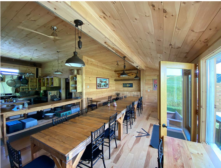
Figure 11. New kitchen, 2019.

Our student programs have also grown. We've gone from two a year in Boston to 10 to 12 now. We bought the student house in 2007. It's the last house in town on Main Street, a 20-minute walk to the farm. Students are here for three months, some in the summer, some in the fall. They come from the US, Latin America, Europe, and Asia. A few years ago people used to laugh at us "crazy theatre people." But now with a lot more students spending money in town, the local people are accepting them. We also have three intensives a year with up to 25 students. In addition to students we also have a residency program for Black