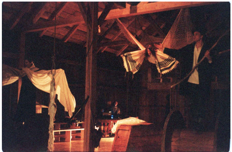
Figure 8. Keter at the Farm , 1997. Directed by Stacy Klein.

The mid-'90s was a trial period. We thought that after we built the barn we could try again in Boston, keeping two spaces. Clearly, that didn't work out. After we got the barn built, the first thing we did was Keter , the Kabbalah in the middle of Ashfield.