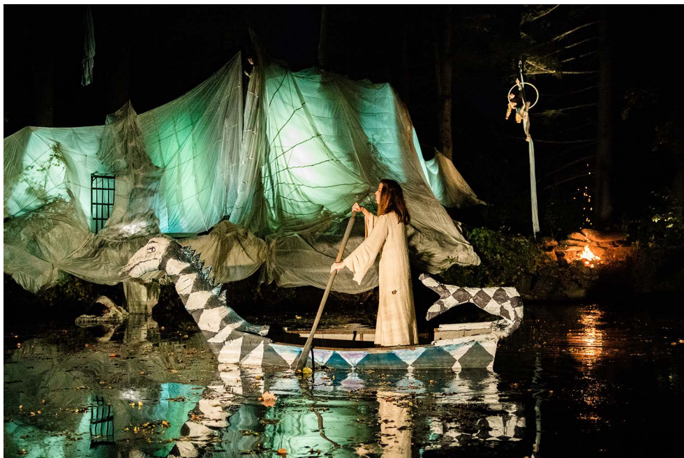
Figure 13. Leonora's World at the Farm, 2019. Directed by Stacy Klein.