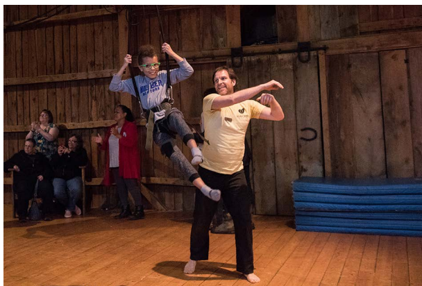
Figure 15. Community Day at the Farm, 2019.