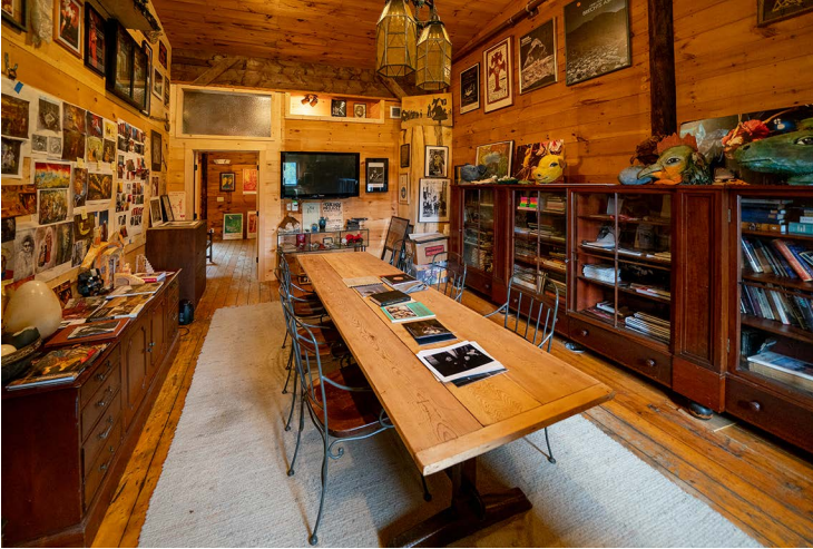
Figure 10. New archive room in pavilion, 2019.

period, we've spent approximately $900,000 on building renovations with more planned for the next three years. The overall budget, including capital building and operating, has increased from $650,000 in FY13 to $1,300,000 in FY19. (In 2002 the budget was $75,000.) We get a lot of money to renovate buildings from the Massachusetts Cultural Council Cultural Facilities Fund. It's much harder to get operating money in a rural area. In 2013, I was awarded the Doris Duke Performing Artist Award, which was a big help [$275,000]. Then in 2017, we received an ArtPlace grant [$275,000] which was another big boost.