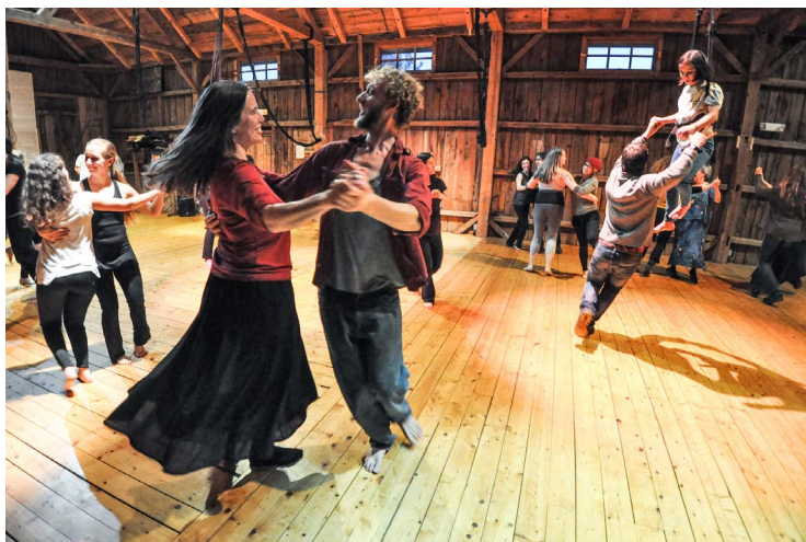
Figure 14. Community Day at the Farm, 2017.

couple of times. In Jamaica Plain we paraded down the street dancing and singing; we rehearsed in the trees and in front of the more or less abandoned cathedral. People came to watch us rehearse. Over weeks they started to trust us. They went into the church for the first time since it was sold to pay for child abuse lawsuits against the Catholic Church. In Springfield we per-