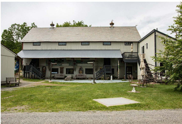
Figure 6. Outside the renovated barn, 2019.