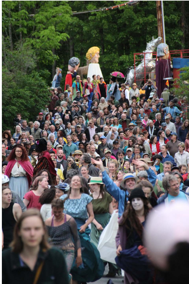
Figure 17. Parade in The Ashfield Town Spectacle, Ashfield, 2017. Directed by Stacy Klein.

SCHECHNER: So you are knitting the theatre into the town. Do they pay to come to your theatre?