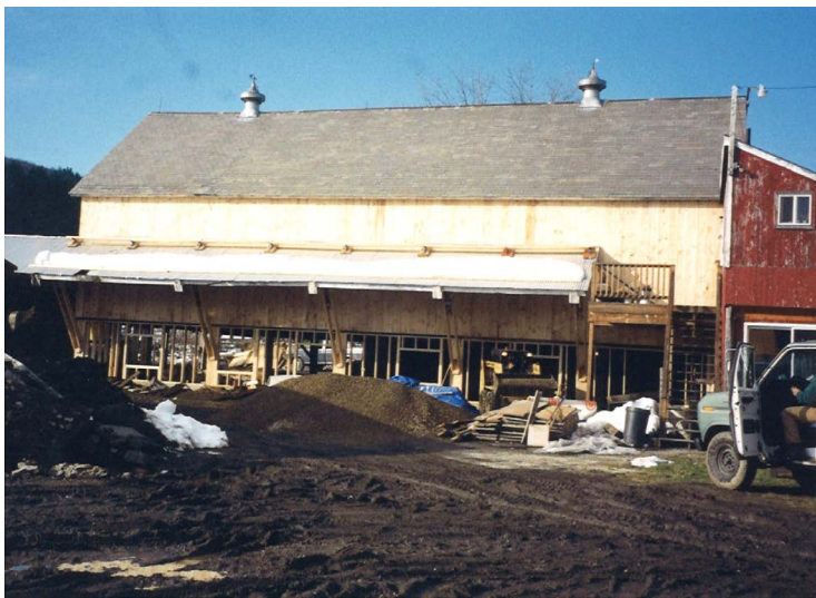
Figure 5. Initial renovations of the Farm, winter 1996/97.

KLEIN: May 3, 1996, my father died. He made the Double Edge Theatre Foundation with part of the money from his estate. There was approximately $500,000 in it.