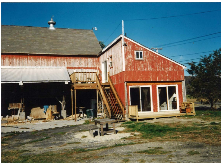
Figure 2. The Farm circa 1994.

KLEIN: It wasn’t related to circus in those days. We were attaching things to ceilings as part of our performances and dangerously flying around. Much later we got some aerial training. All of the Song Trilogy [1985–1998] included some type of flying—I always wanted training to not only deal with